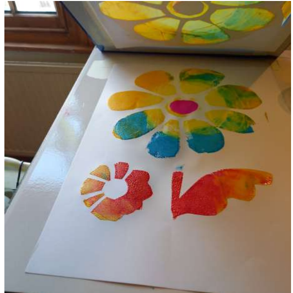
Cut stencil and screened image